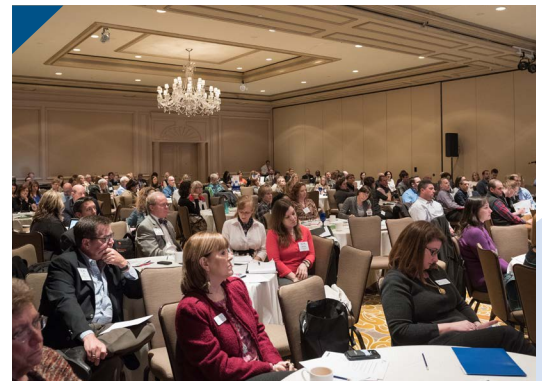
At LAS, PAs and PA students gain knowledge and skills to shape the future of the profession.