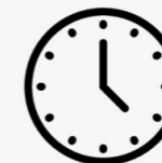
5 minute preceptor