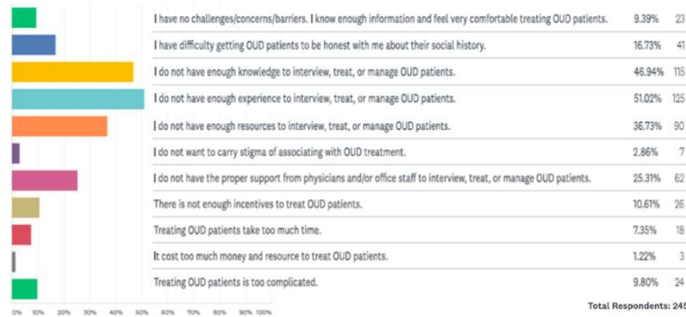
Figure 1: Responses to a survey question "what are your challenges, concerns, or barriers that prevent you from effectively treating OUD patients?"

The result from the pre-test and post-test indicated that there was a difference in knowledge gained. Prior to viewing the educational material, average pre-testing score was 75% whereas the average post-test scoring was 86.4%.