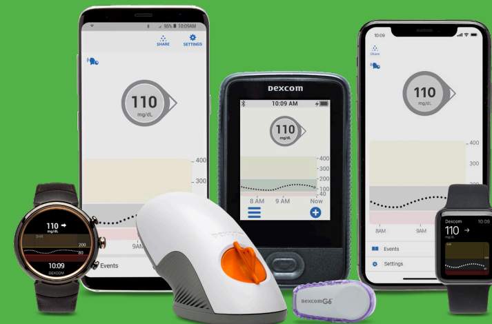
Smart devices sold separately.