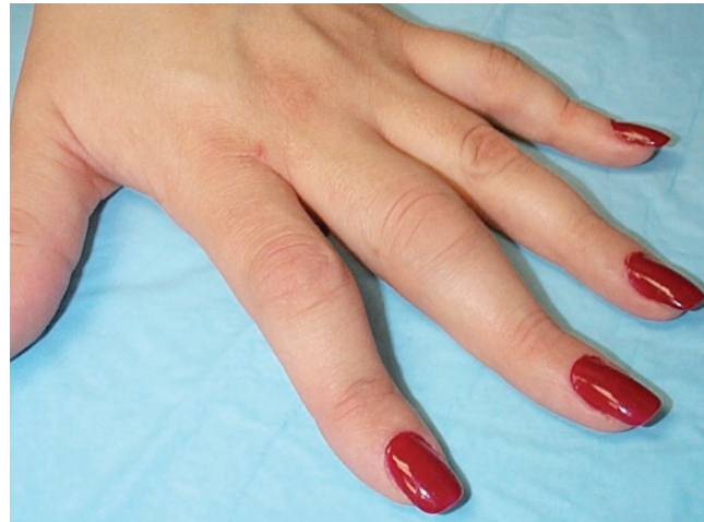
FIGURE 1. Inflammation of the MCP and PIP joints in a different patient

Patients with psoriatic arthritis typically have a history of a psoriatic rash (erythematous plaques with silvery-white scale on the extensor surfaces). Most of the time the rash appears before the joint symptoms