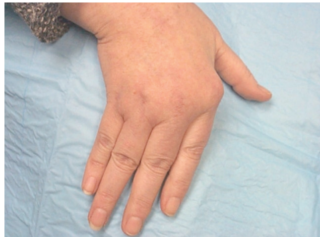
FIGURE 2. Inflammation of MCP joints with ulnar deviation