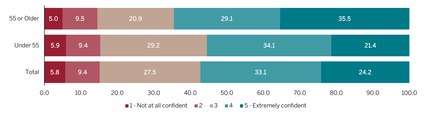
Figure 2. Confidence Prepared for Intended Retirement Age

Question: "How confident are you that you will be prepared to retire at [piped response]?" Note: When p is blank, there are no differences between age groups; *indicates a significant difference was found between age groups at the: