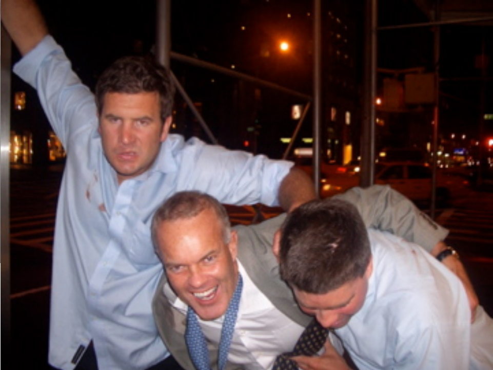
'MIAMI STYLE F&A TRAUMA' PAOS, San Antonio, 2019