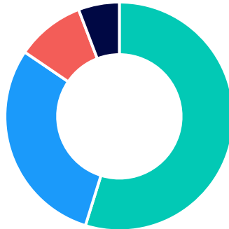
Percent of PAs by Setting in South Carolina