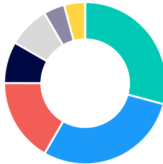
Percent of PAs by Specialty in Wyoming

Number of PAs in the United States: 178,700