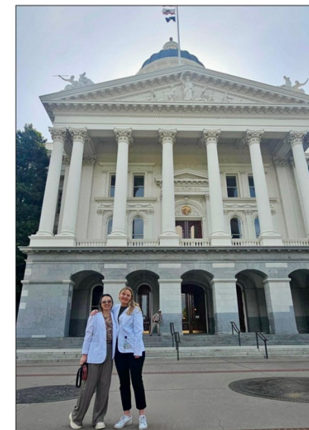
PA Students in front of CA State Capitol in Sacramento

Zoom Webinar Slides Overviewing the Initiative