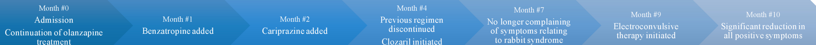
Figure 1: Hospital Course